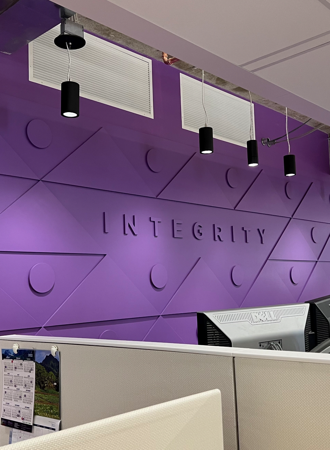
The Integrity Wall is a prominent feature that reinforces one of our core values: To do the right thing. Always.